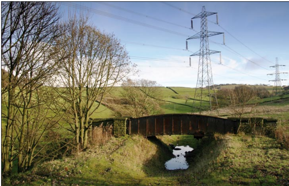
The view looking east from the former site of Queensbury signal box