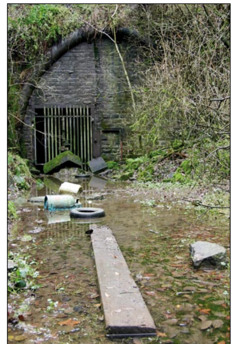
(Above) Queensbury tunnel's northern portal looking the worse for wear and (left) a wider view of the station site, covered by landfill

Walkers and cyclists might soon breathe some life into this industrial burial ground. Plans are in hand to extend a footpath, recently constructed further up the trackbed. Queensbury's geometric masterpiece will not return but its place in railway history cannot be erased. As Eric Brook proudly states, "It was the cream!"