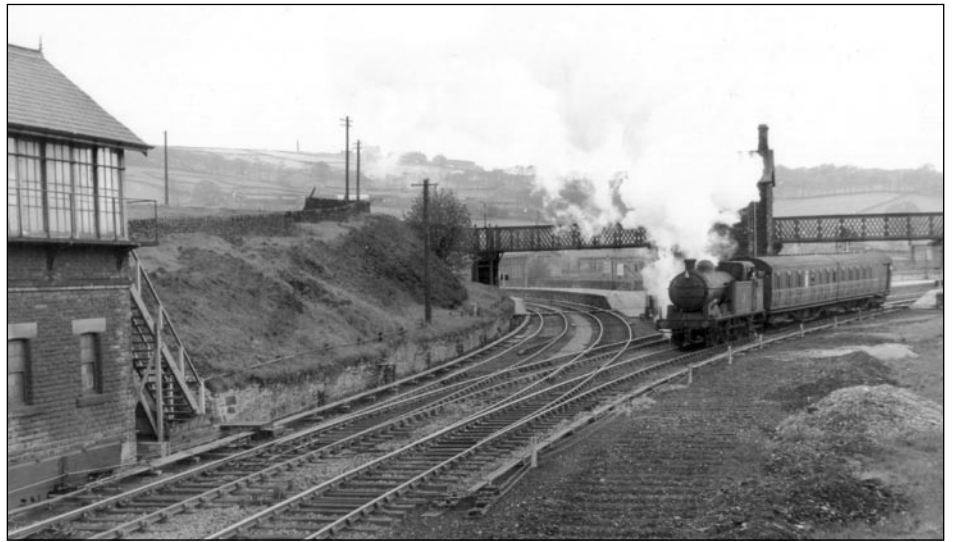
A Keighley-Bradford train approaches Queensbury signal box in May 1955